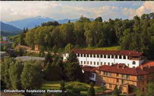
Cittadellarte Fondazione Pistoletto