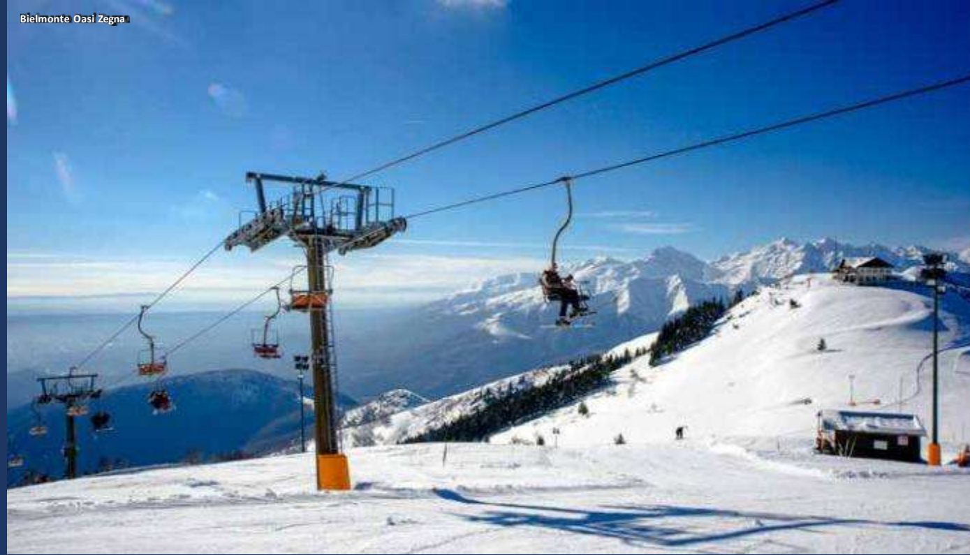
Bielmonte Oasi Zegna