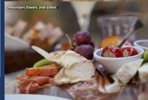
Mountain flavors and colors