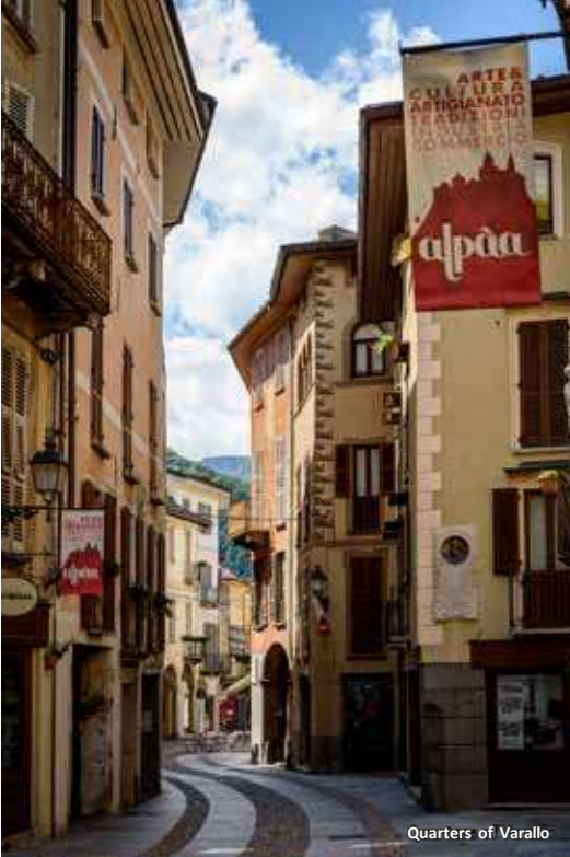
Quarters of Varallo