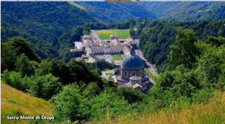
Sacro Monte di Oropa