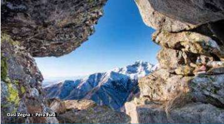
Oasi Zegna - Perai Furà