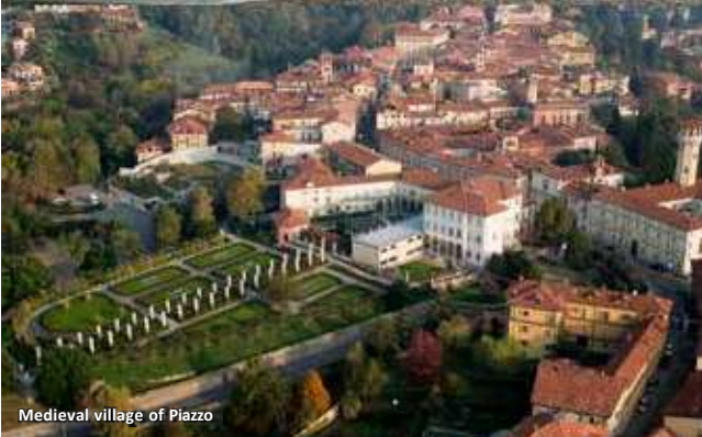
Medieval village of Pizzo

The UNESCO World Heritage recognition of the territory does not end with the splendid Sacro Monte di Varallo but also involves the Biella area, in particular, the Sanctuary and Sacro Monte di Oropa (located at an altitude of about 1,200 meters) in a journey "between earth and sky" to discover nature and the sacred. Such a discovery can continue with a visit to the other three important Alpine sanctuaries, places of faith and artistic interest: Graglia Sanctuary, San Giovanni di Andorno Sanctuary, and Brughiera Sanctuary , where it is possible to stay overnight.