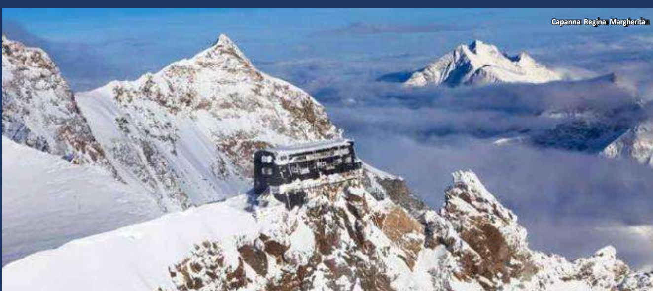
Capanna Regina Margherita

mountaineering (a popular destination is the Capanna Regina Margherita , the highest hut in Europe), from climbing to paragliding, and the many alternatives on two wheels, MTB and Trial among them, and the various cycle paths that allow you to explore almost the entire territory from Alagna to Guardabosone.