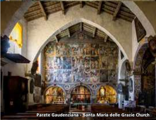
Parete Gaudenziana - Santa Maria delle Grazie Church