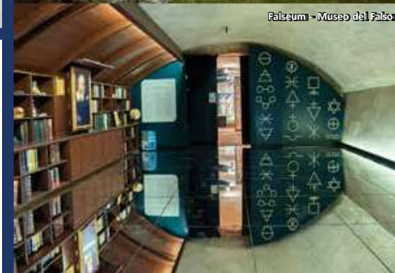
Falseum - Museo del Falso