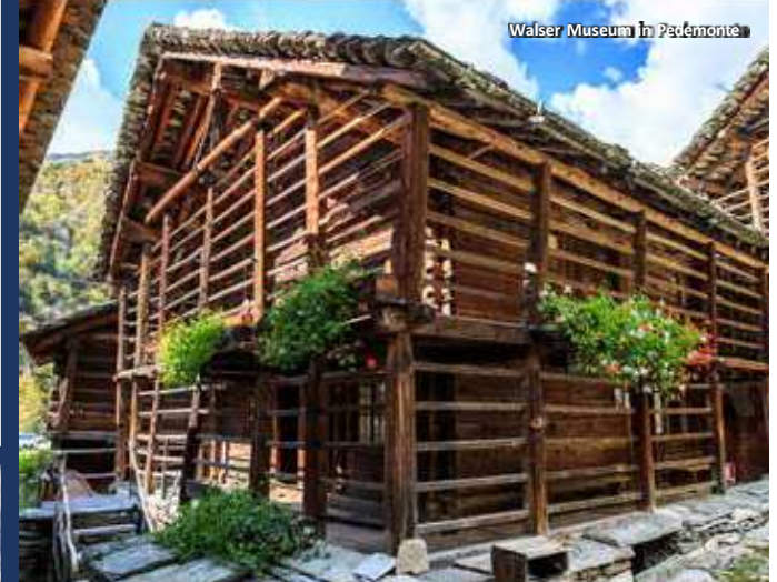
Walser Museum in Pedemonte