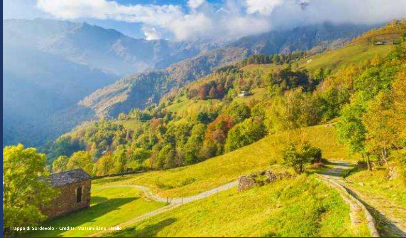
Trappa di Sordevolo