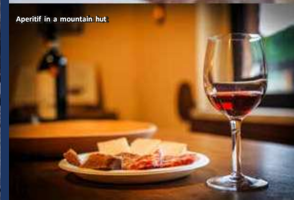
Aperitif in a mountain hut