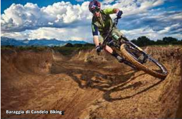
Baraggia di Candelo Biking