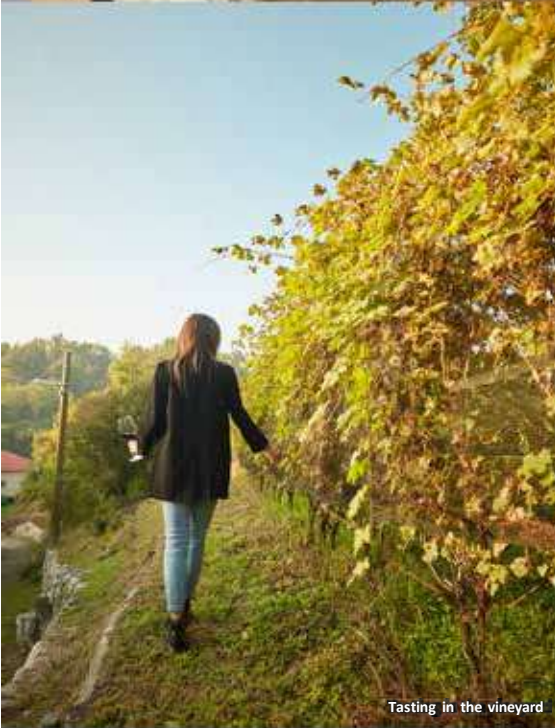
Tasting in the vineyard