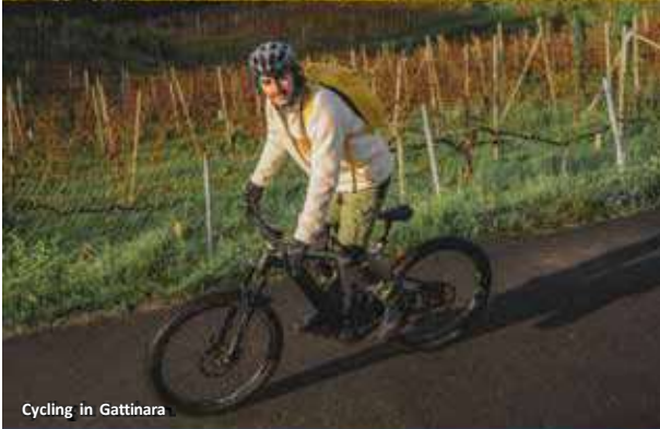
Cycling in Gattinara