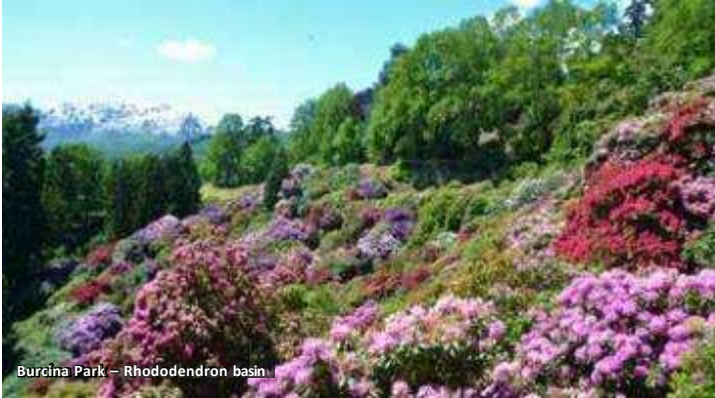
Burcina Park - Rhododendron basin