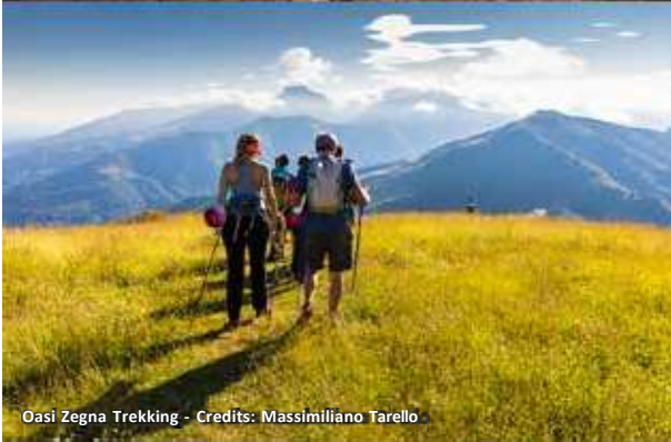
Oasi Zegna Trekking