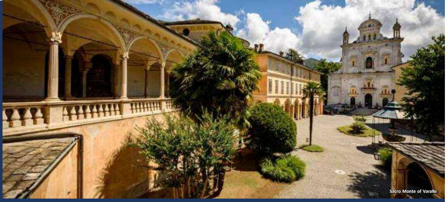
Sacro Monte of Varallo