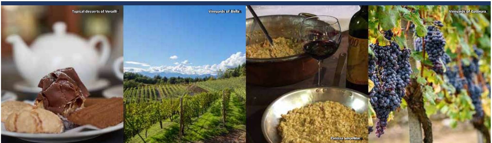
Typical desserts of Vercelli

These are the Lands of Nebbiolo ; a vine whose grapes produce full-bodied and long-lived red wines, but above all wines that can be skilfully combined with traditional dishes. The hilly area in the province of Vercelli, between the municipalities of Gattinara, Lozzolo, and Roasio, produces some of the best red wines in Italy in terms of quality, delicacy, and harmony: these are Gattinara DOCG, Bramaterra DOC, and Coste della Sesia DOC .