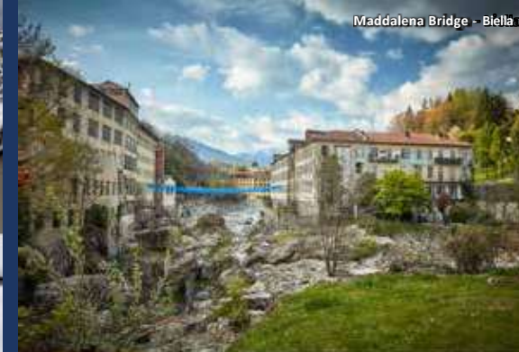
Maddalena Bridge - Biella