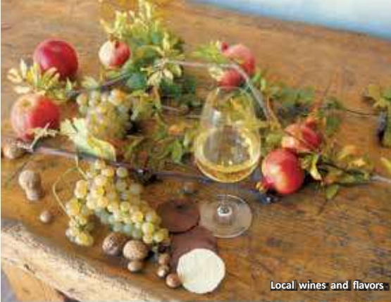
Local wines and flavors