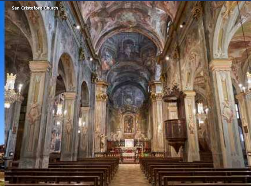
San Cristoforo Church