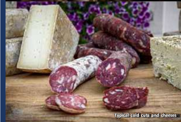
Typical cold cuts and cheeses