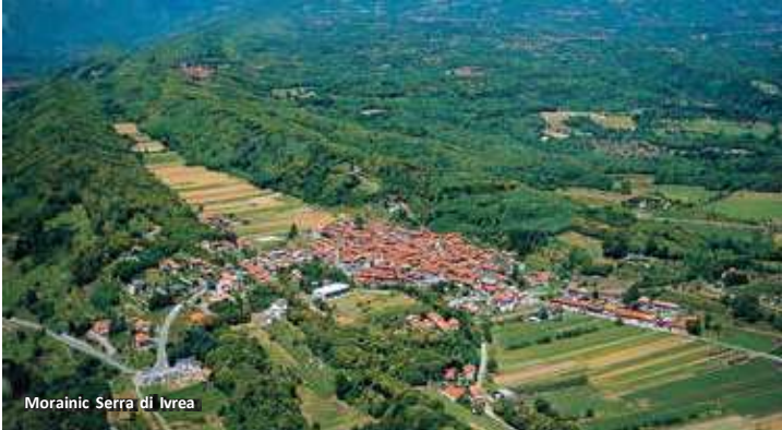
Morainic Serra di Ivrea