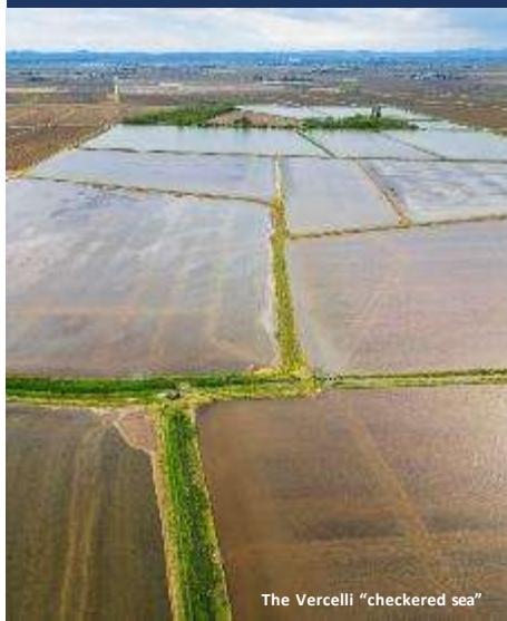
The Vercelli “checkered sea”

Moving towards the border with the province of Biella, one is greeted by a truly unusual landscape: that of the Rive Rosse (whose name derives from the particular color of the soil), where areas of low vegetation, rocky hills, gullies, and ridges alternate with vineyards and small streams.