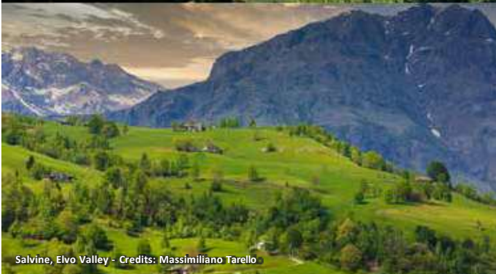
Salvine, Elvo Valley