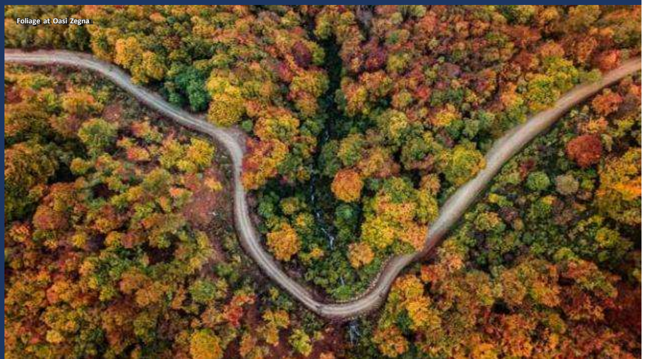
Foliage at Oasi Zegna