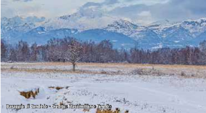
Baraggia di Candelo