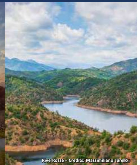
Rive Rosse