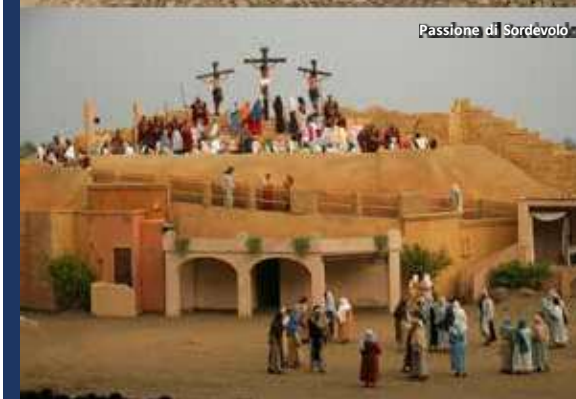
Passione di Sordevolo