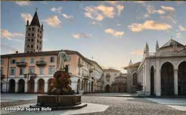
Cathedral square Biella