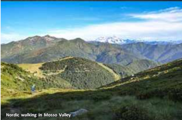
Nordic walking in Mosso Valley