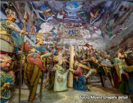
Sacro Monte chapels detail