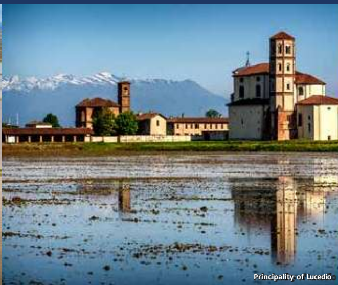
Principality of Lucedio