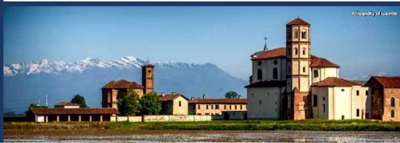
Principality of Lucedio

Moving towards the province of Biella border, one is greeted by a truly unusual landscape: that of the Rive Rosse (whose name derives from the particular color of the soil), where low vegetation areas, rocky hills, gullies, and ridges alternate with vineyards and small streams.