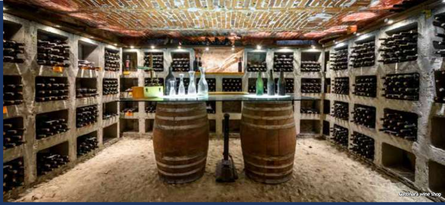
Gattinara wine shop