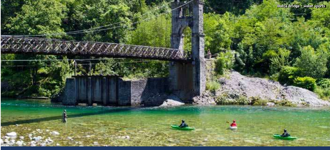
Morca Bridge - water sports