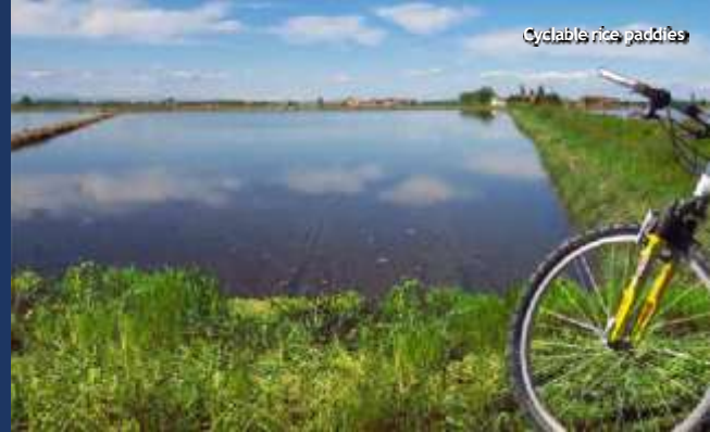
Biking in Valsesia