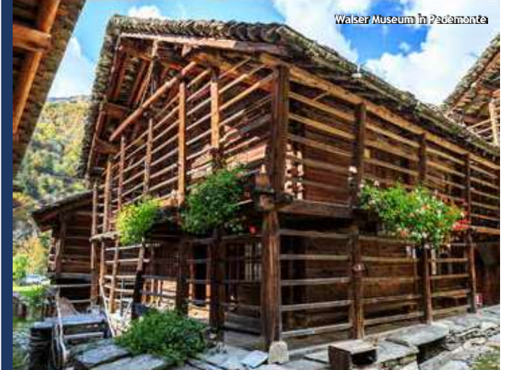
Walser Museum in Pedemonte