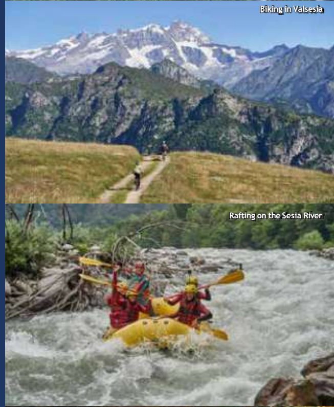
Rafting on the Sesia River