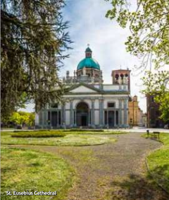
St. Eusebius Cathedral