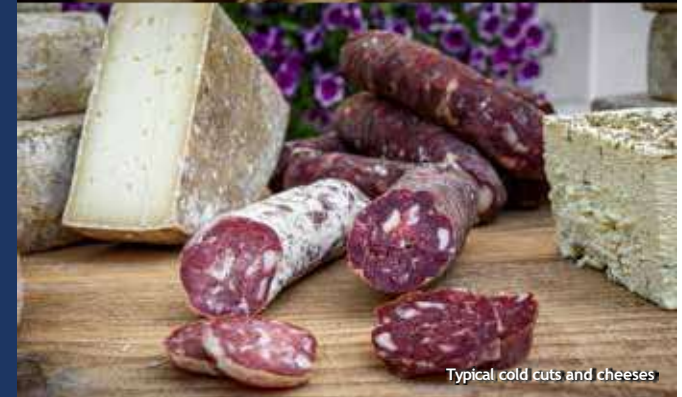
Typical cold cuts and cheeses