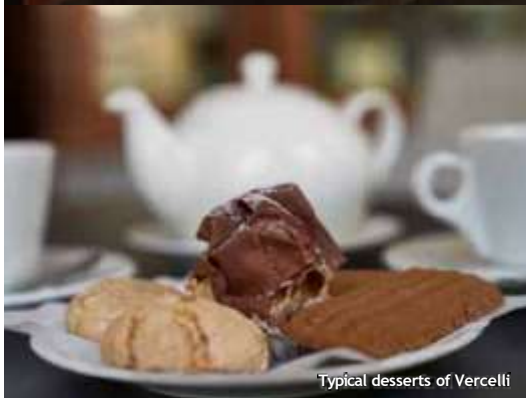
Typical desserts of Vercelli