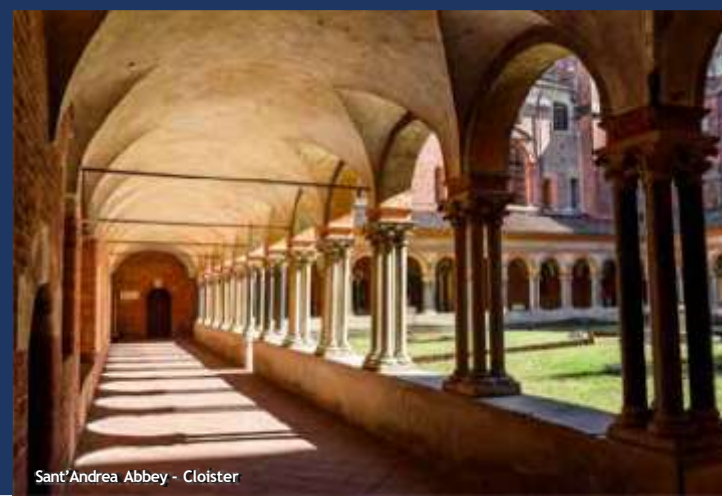
Sant'Andrea Abbey - Cloister