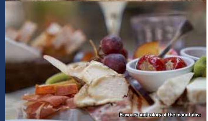
Flavours and colors of the mountains