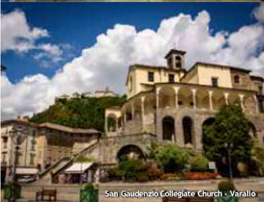
San Gaudenzio Collegiate Church - Varallo