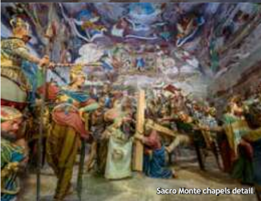
Sacro Monte chapels detail