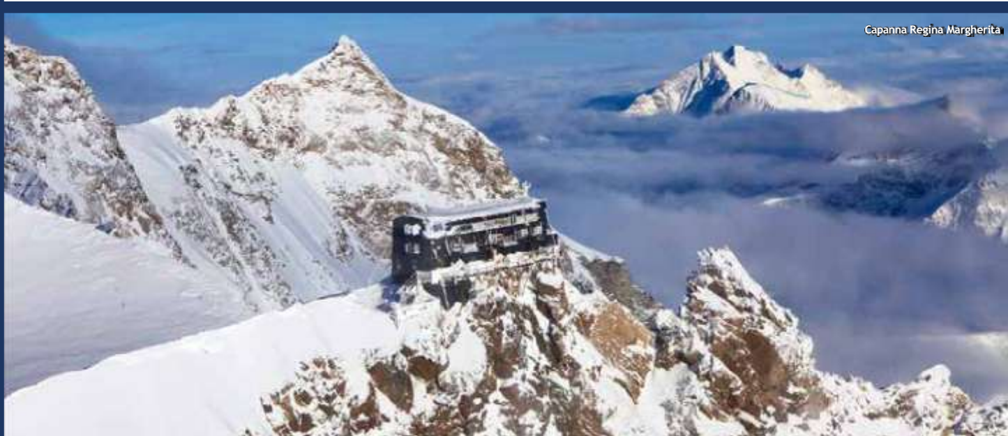
Capanna Regina Margherita

Summer, of course, also means mountain biking, and the four Alta and Bassa Valsesia cycle paths offer truly exciting views for lovers of two wheels and unspoiled nature. There are many proposals for itineraries that can be covered completely or partially, choosing according to the level of difficulty and the area you wish to visit; some examples are the cycle path from Borgosesia or Guardabosone to Varallo, the Mera cycle (and pedestrian) loop, and the e-bike or mountain bike excursions on the routes from Balmuccia to Alagna.