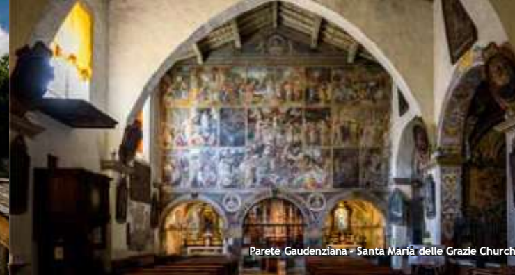
Parete Gaudenziana - Santa Maria delle Grazie Church