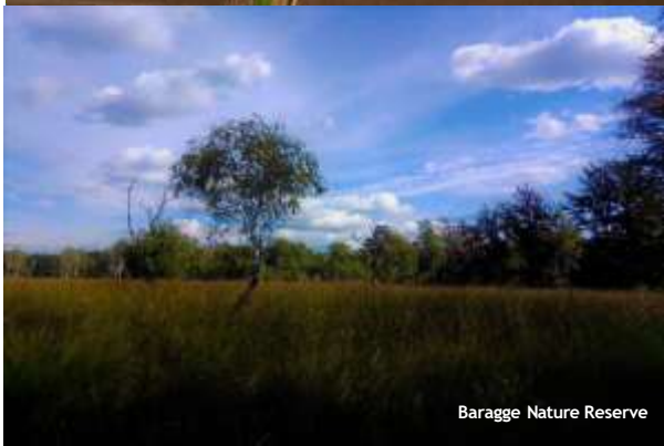
Baragge Nature Reserve