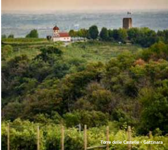
Torre delle Castelle - Gattinara