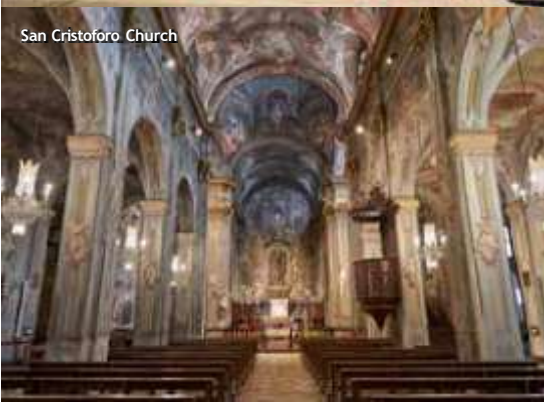
San Cristoforo Church