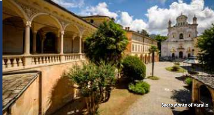
Sacro Monte of Varallo