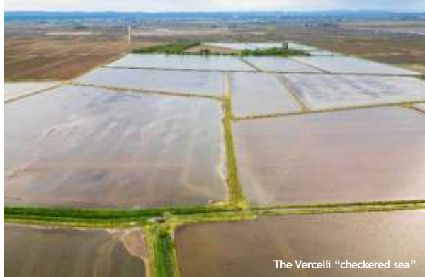
The Vercelli "checked sea"