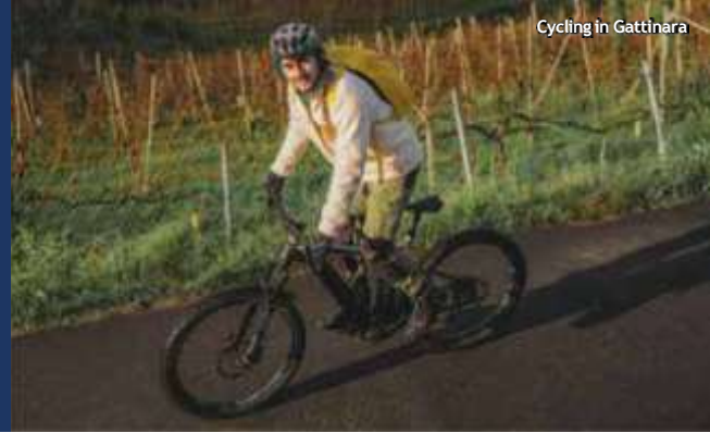
Cycling in Gattinara

Rich in architectural and scenic testimonies and ingenious hydraulic works, these itineraries allow you to discover the Vercelli countryside and some of its treasures such as the Cavour canal, the Baraggia, the Grange, nature parks, and the many farms and rice mills that produced for generations, where you can taste wines and local specialties .