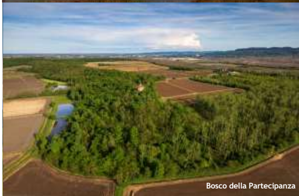
Bosco della Partecipanza