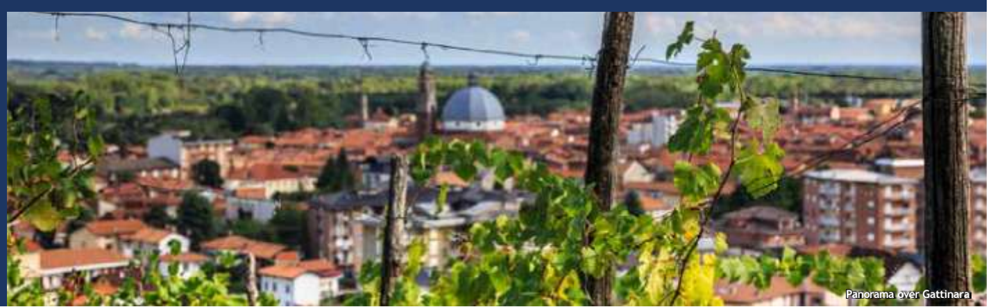
Panorama over Gattinara